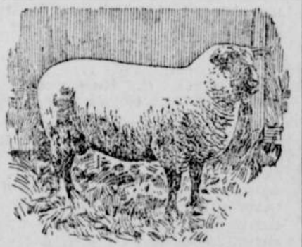
THE SUFFOLK SHEEP.

The Suffolk Sheep. This beautiful sheep is a fair representative of another descendant of the Southdown breed to which it owes all those peculiarities, except size, that have been given to every cross bred race of sheep in which the Southdown blood flows. It more closely resembles its half parent than the Shropshire does, having a smoother body, a finer fleece, and more of the broad loin than this possesses. It is a new breed, having only been admitted to the English exhibitions as a distinct class ten years ago, although its foundation began by the first cross of the Southdown on an ancient race, a hardy, horned, black-faced sheep existing from time immemorial in the County of Suffolk, in England. This sheep is a special mutant breed. Its fleece, however, being valued highly for the manufacture of