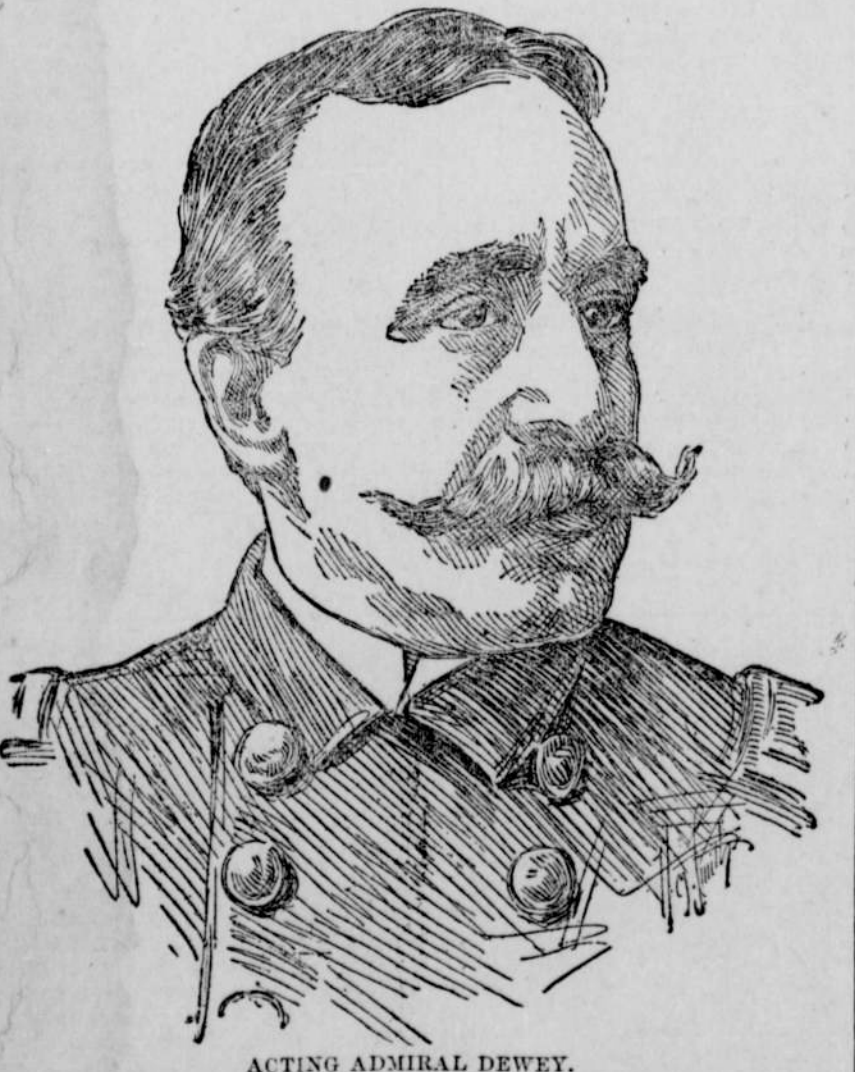
ACTING ADMIRAL DEWEY.