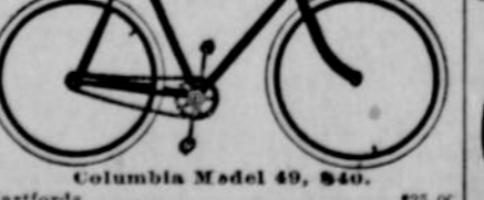
Columbia Model 49, $40.

Bacon—What do you think of the war so far? Egbert—Well, I think if the American eagle isn't hoarse it must have an unusually strong throat.—Yonkers Statesman.