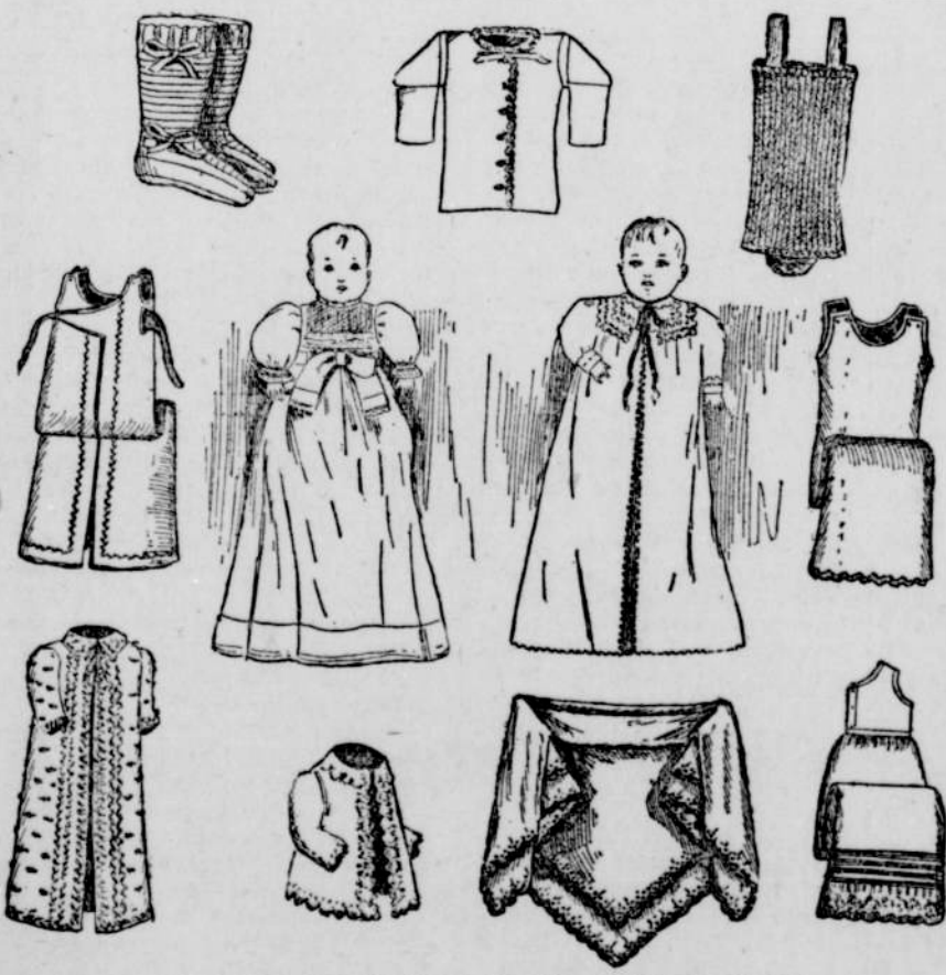
BELONGINGS OF THE DRESS REFORM BABY.

One of the more useful additions to common-sense dress reform for the baby are the "booties," which came out but a few months ago. They are hand-knitted foot coverings that come to the knee, where they are fastened with a tiny ribbon. "Booties" make unnecessary the rather awkward-looking pinning blanket. They are dainty little things, with delicate borders of pale pink or light blue.