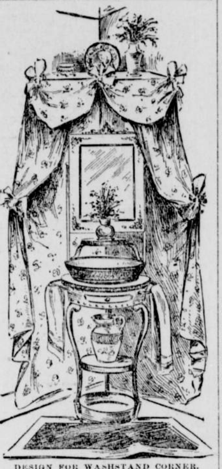
DESIGN FOR WASHSTAND CORNER.

THE foundation for a very dainty washstand and dresser, to be used summer and winter, is a corner, some drapery and a set of tin toilet articles. The corner is always obtainable and the drapery can be purchased, if you choose denim, cretonne or silk-line, for about 8 cents per yard. The tin toilet sets come for 75 cents upward, to a very nice one for $1.50. The beginning of this corner is a triangle