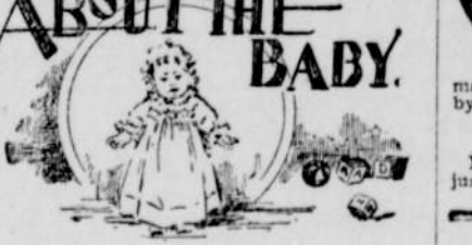
ABOUT THE BABY.