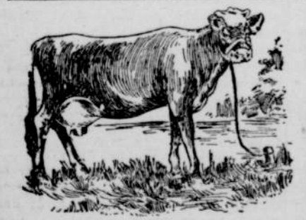
GYPSEY QUEEN II.

At the last Southampton show in England Jersey cows made a notable display, both as to numbers and quality. One of the Rothschilds is a special breeder of these cattle at his country place, Tring Park, Herts. Lord Rothschild's Jersey cow Gypsy Queen II. took first prize at Southampton.