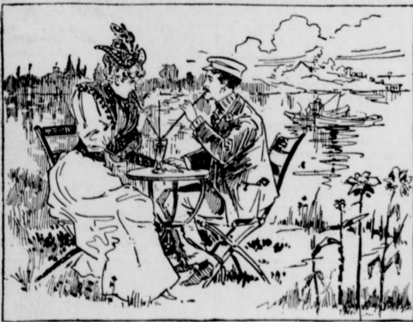
TWO THIRSTS WITH BUT A SINGLE GLASS.

The fact that $14,225, the largest amount ever paid at one time into the "conscience fund" of the United States Government, has been received within the last year, is a cheering indication that some men are growing better instead of worse.