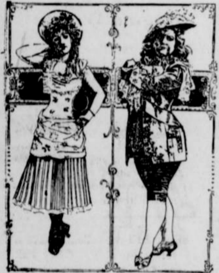
LILLIAN RUSSELL. As She Was. As She Is.

My system of what is commonly called "doing banting" is a vigorous one, says Lillian Russell, in the New York Journal. I rely mainly upon severe exercise, producing profuse perspiration,