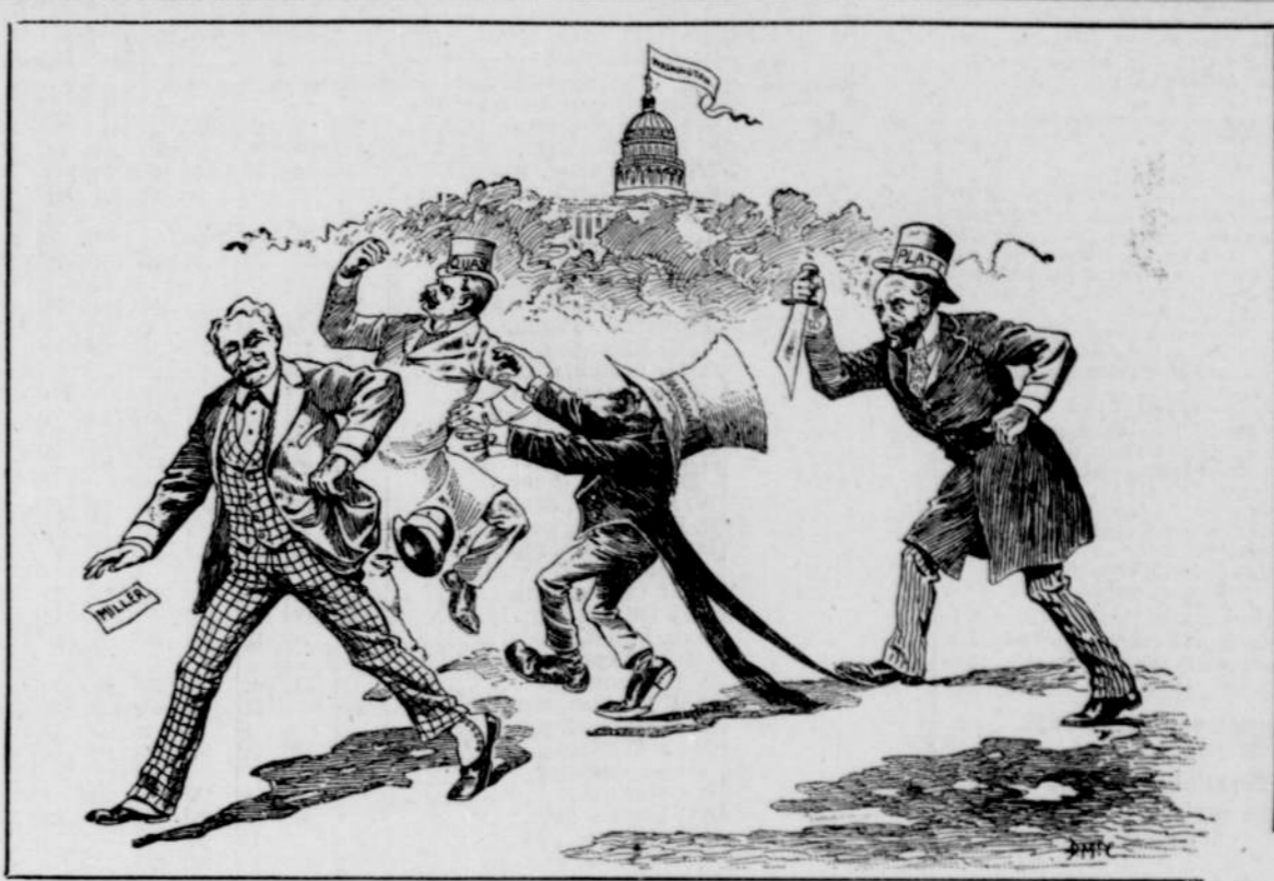
A Game of Blind Man's Buff.

Of late years Rosa Bonheur has painted only heads or single figures of animals, but there is now an exhibition in London a recent work from her studio showing a group composed of a lion, a lioness and several cuts. The background is a representation of an African scene, with palm, date and aloes trees and a mountain range in the distance.