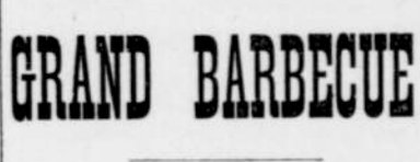
One Ton of Meat to be Used in Celebrating the Fourth of July at McMinnville.

Great Preparation is being made to Make this Celebration the Largest and Most Successful Ever Held in Yamhill County.