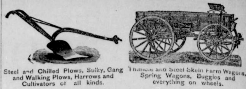
Steel and Chilled Plows, Sulky, Gang and Walking Plows, Harrows and Cultivators of all kinds. Timmer and Steel Skein Farm Wagons, Spring Wagons, Buggies and everything on wheels.