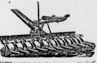
implement in use.