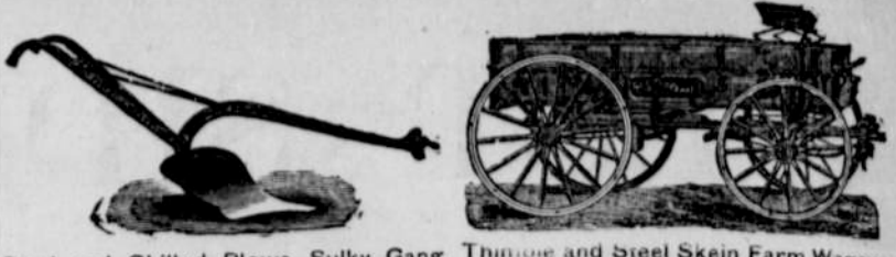
Steel and Chilled Plows, Sulky, Gang and Walking Plows, Harrows and Cultivators of all kinds. Thomas and Steel Skein Farm Wagons, Spring Wagons, Buggies and everything on wheels.