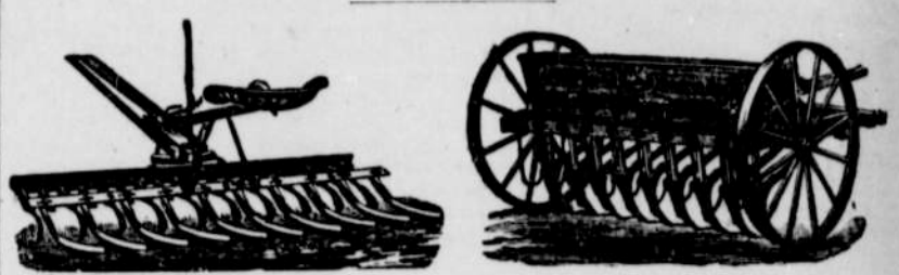
Acme Harrow, Old Fashioned and Lever Most effective and serviceable farm implement in use. 2-1-m6 Hoosier force feed Seeders and Drills with truss axle and wide tires. HOOSIER RUNNER PRESS DRILL. Latest improved and best seeder in use.

Wagons, Buggies and Carriages. Binder Twine, Belting, Oils, and Machine Supplies of all kinds. Call and See Us.