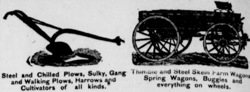
Steel and Chilled Plows, Sulky, Gang and Walking Plows, Harrows and Cultivators of all kinds. Timble and Steel Skein Farm Wagons, Spring Wagons, Buggies and everything on wheels.

Old and reliable medicines are the best to depend upon. Acker's Blood Elixir has been prescribed for years for all impurities of the Blood. In every form of Scrofulous, Syphilitic or Mercurial diseases, it is invaluable. For Rheumatism, has no equal. Geo. W. Burt, druggist.