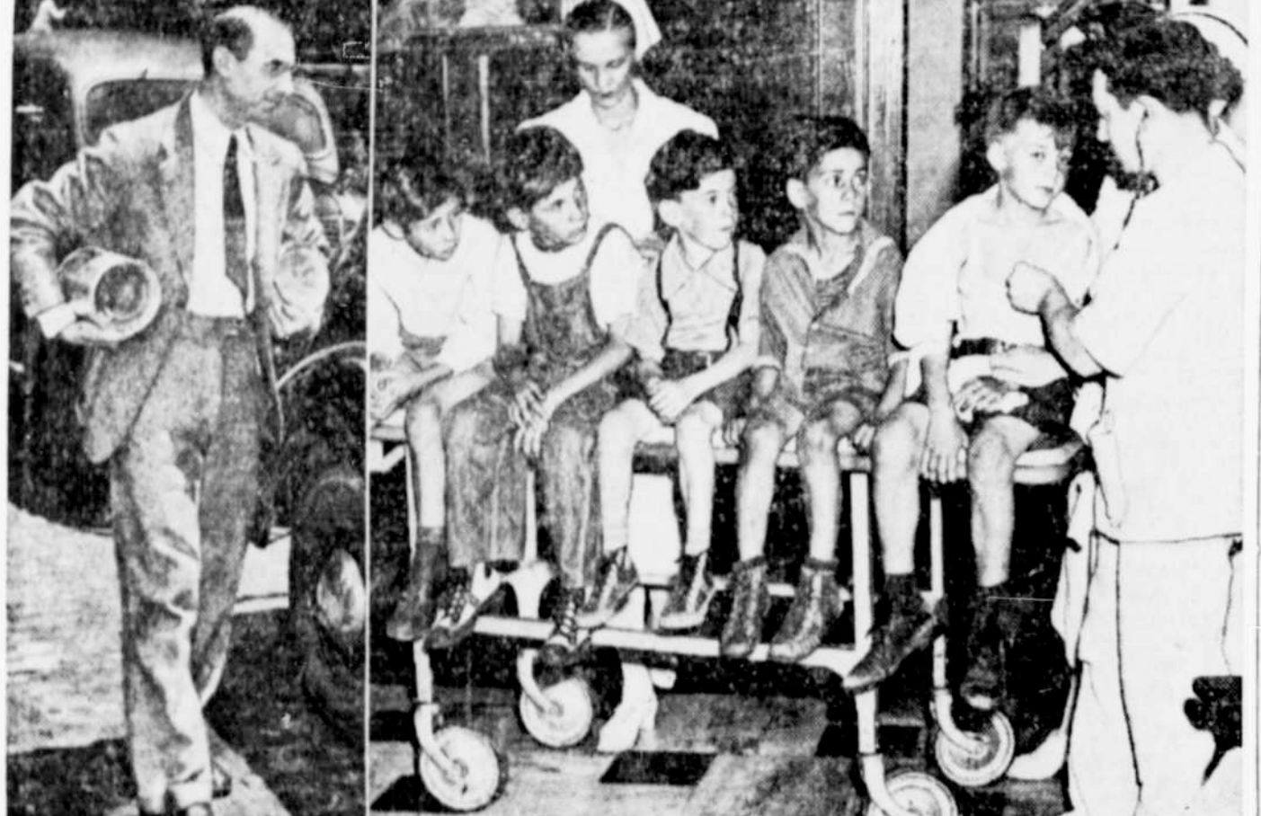
Hoess Housing Plan May Be U. S. Model