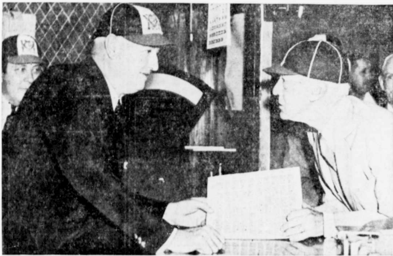
The sale of a stamp series commemorating the founding of baseball got off to a flying start in Cooperstown, N. Y., recently when Postmaster General James A. Farley sold the first stamps to Judge Kene-saw Mountain Landis, baseball commissioner. There Abner Doubleday founded baseball 100 years ago.