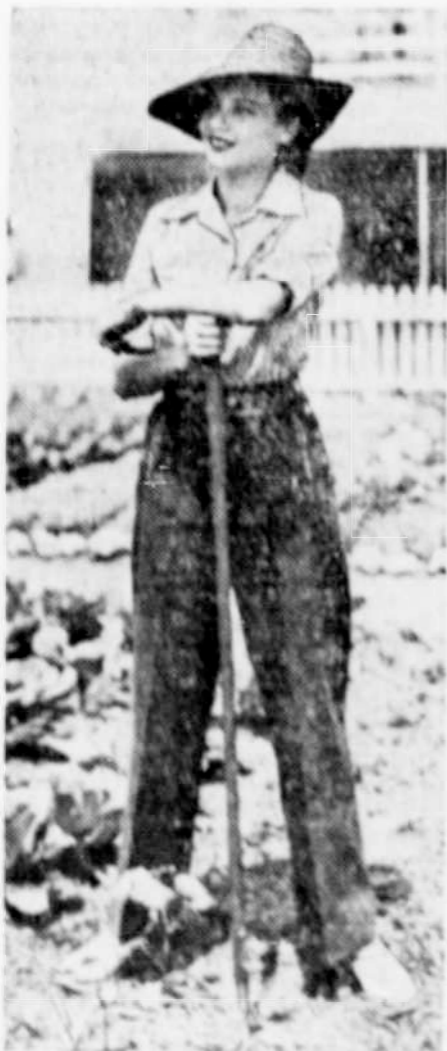
These tile-red denim slacks are worn with a striped shirt of men's wear madras shirting. The straw hat is red also.