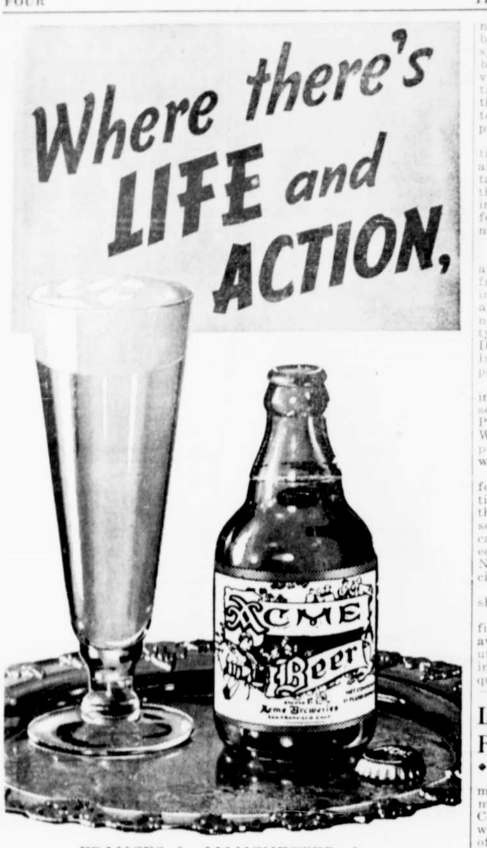
FRANCES L. MANCHESTER, Inc. HOOD RIVER COUNTY DISTRIBUTOR