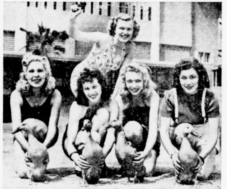
These Arcadia, Calif., ducks, under the supervision of their attractive trainers, were part of a large field of entries at the first annual duck race at Santa Anita racetrack recently. Members of this feathered quartet were heavy favorites when they waddled to the post, but none of them finished in the money.