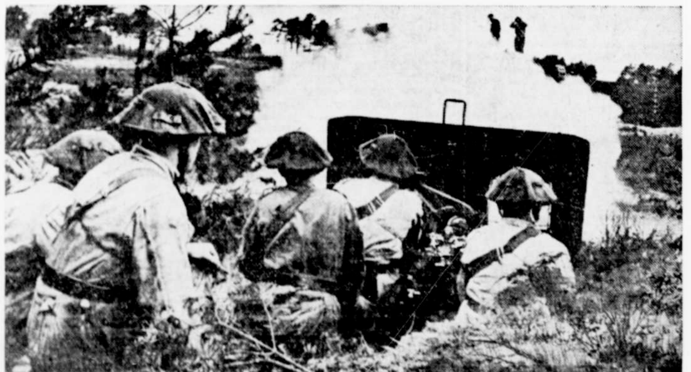
An anti-tank gun crew in action during recent exercises of the tank division at Aldershot, England, which were witnessed by many high-ranking army commanders. The exercises were part of mimic warfare games held recently to gauge army strength and to demonstrate preparedness. Other branches of the army demonstrated their might before British dignitaries.