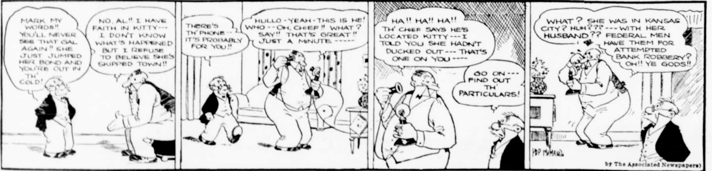
POP — Call for a Burglar