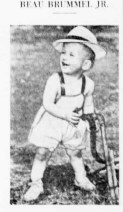
This immaculately turned-out young New Yorker has topped his tan sun suit with a modern streamfined version of his father's straw hat, even to the contrasting band. heat from the head.