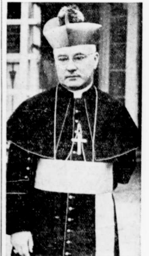
Patrick Cardinal Hayes. It is thought that he will be named a cardinal in the consistory to be held early this summer.

Monsignor Francis J. Spellman, auxiliary bishop of Boston, has been named archbishop of New York by Pope Pius XII. He succeeds the late