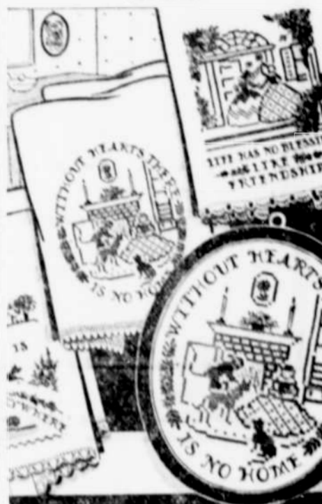
Pattern No. 6242

You'll love these quaint motifs that make a hit wherever they're used! The appropriate mottoes (they come in pairs) make them unusual as towels and equally effective as small pictures or for pillow-tops. They're mainly in 10 to the inch cross-stitch with a bit of other simple stitchery to lend variety. They're fascinating to do. Pattern 6242 contains a transfer pattern of 6 motifs averaging 5 1/2 by 7 3/4 inches; color schemes; materials needed; illustrations of stitches.