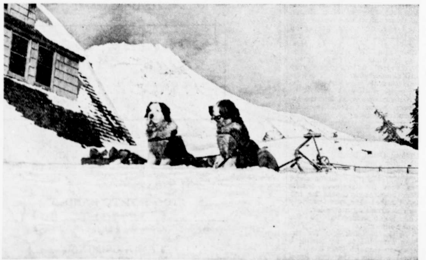
Massive, friendly and famous are Lady, left, and Breuhl, the huge St. Bernard dogs who dwell at Timberline lodge on Mount Hood. The dogs are hitched to a toboggan at the mile-high Oregon resort. In the background is Mount Hood's two-mile peak. Lady and Breuhl gained national fame last summer when they accompanied climbers to the mountain summit. Lady made the descent alone, but Breuhl lost his nerve.