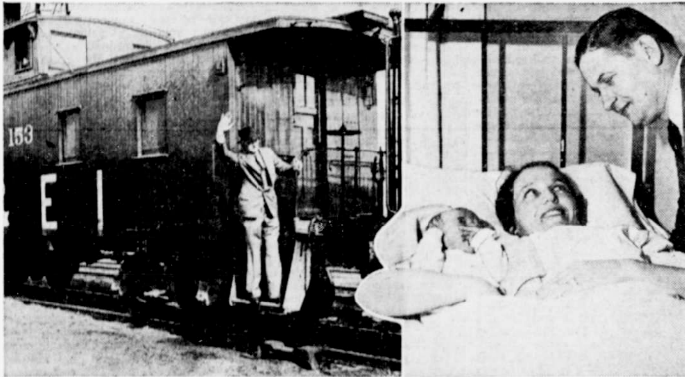
But West Point Was Never Like This