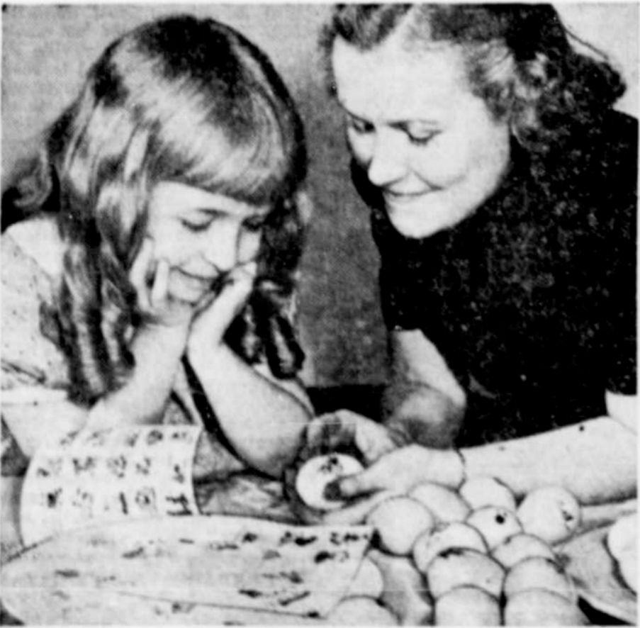
Colored eggs are as popular as ever this Easter, and children can decorate them with an unending variety of designs. This youngster has a whole parade of pets and other designs in decals for transfer to the eggs. While her mother looks on she dips the design in water, slides off the backing-paper onto the egg and smooths it with a cloth. It's art made easy.