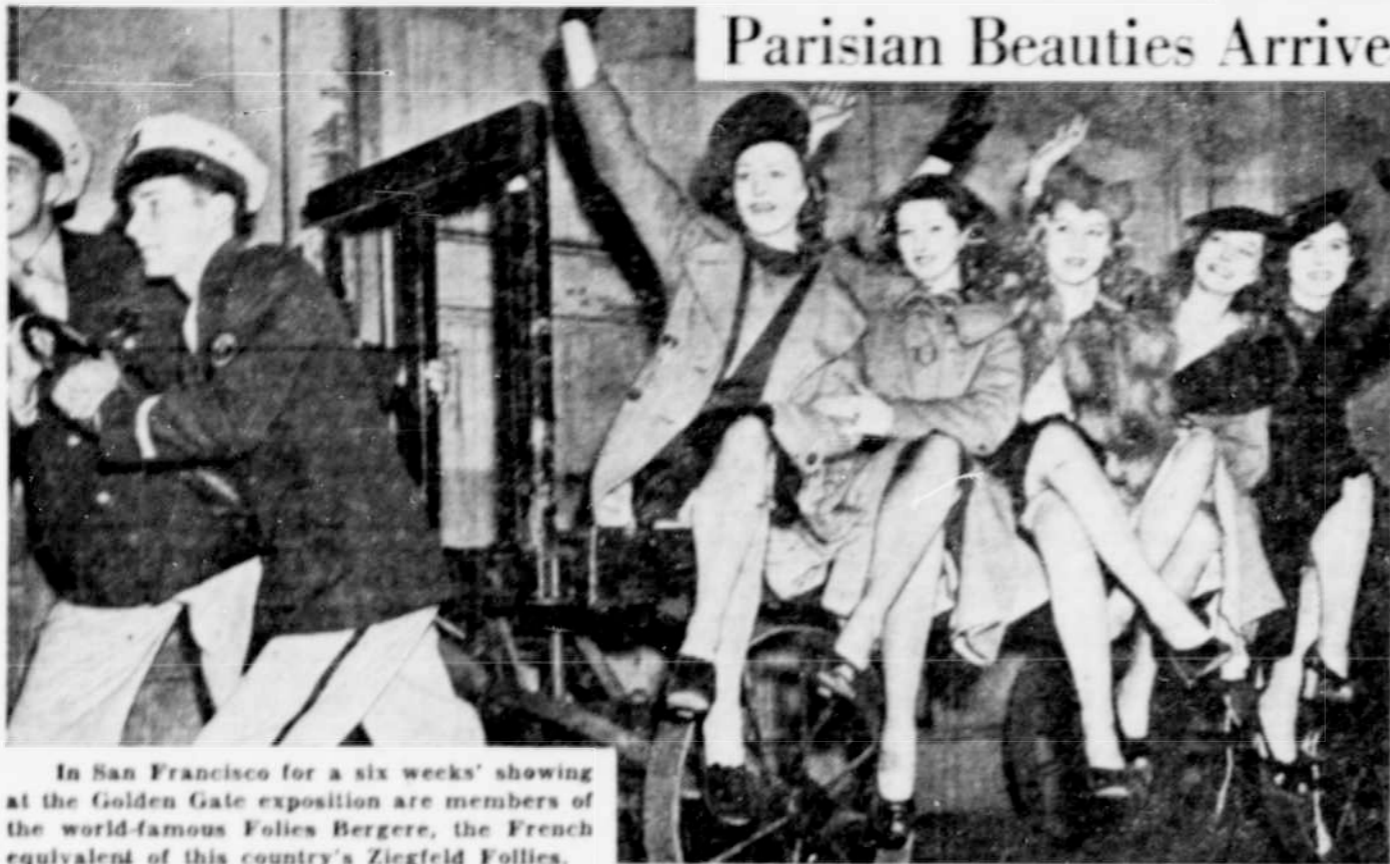
Parisian Beauties Arrive

In San Francisco for a six weeks' showing at the Golden Gate exposition are members of the world-famous Folies Bergere, the French equivalent of this country's Ziegfeld Follies.