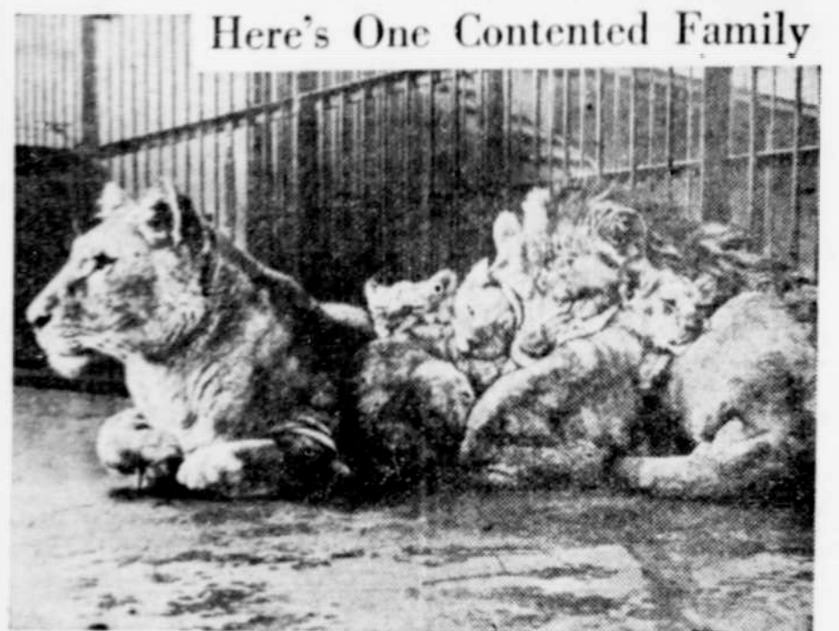
Here's One Contented Family

In San Francisco for a six weeks' showing at the Golden Gate exposition are members of the world-famous Folies Bergere, the French equivalent of this country's Ziegfeld Follies.