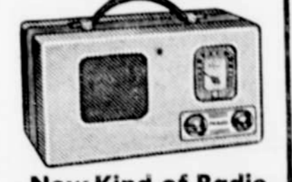
New Kind of Radio — Plays Anywhere!