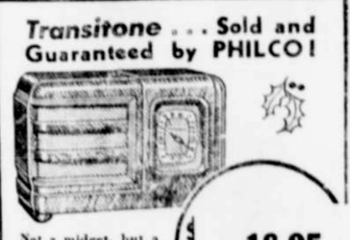
Transitone... Sold and Guaranteed by PHILCO!