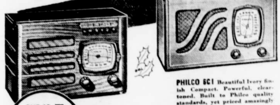
PHILCO 6C1 Beautiful Ivory finish Compact. Powerful, clear-toned. Built to Philco quality standards, yet priced amazingly low!