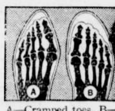
A—Cramped toes. B—Natural position of toes in Dr. Scholl's Shoes.