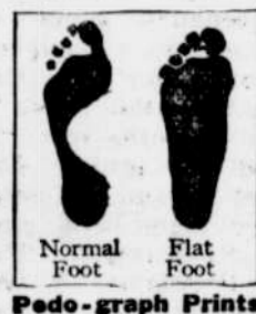
Normal Foot Flat Foot Podo-graph Prints