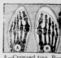
A—Cramped toes. B—Natural position of toes in Dr. Scholl's Shoes.