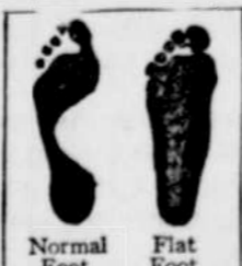
Normal Foot Flat Foot Podo-graph Prints