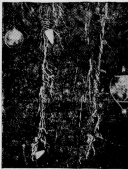
If Christmas tree lamps do not fit well in sockets it may be possible for tinsel or other metal decorations to make contact between two sockets and cause a short circuit.

Electric lamps for Christmas trees have largely eliminated a very serious fire hazard, that of decorating trees with lighted candles. For this reason their use should be encouraged.