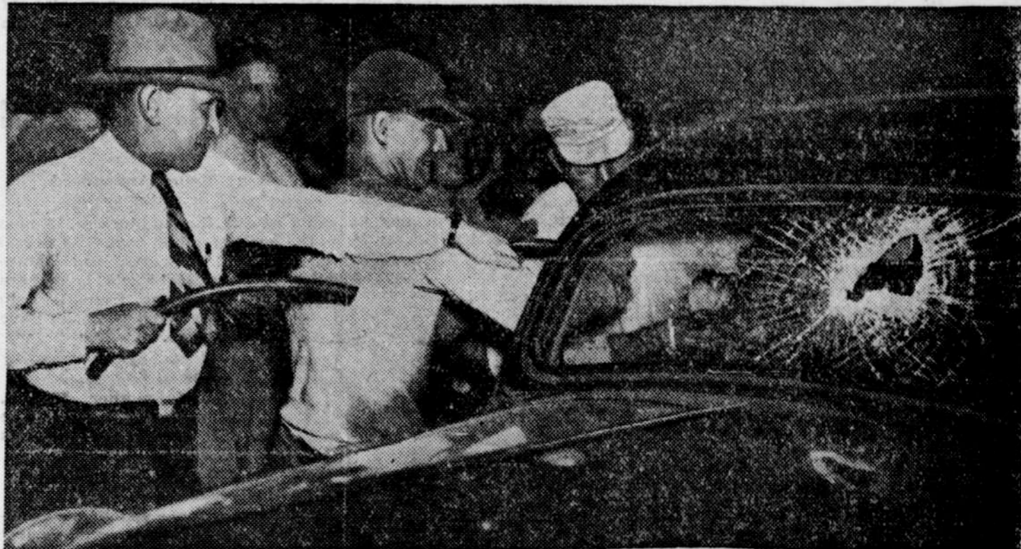
More than 100 persons were injured and one man was killed in rioting which flared up at a Cleveland plant of the Republic Steel company. Five hundred strikers and non-strikers are estimated to have taken part in the melee. Picture shows strikers breaking the glass of an automobile carrying non-strikers.