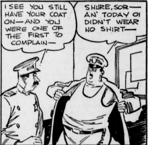
Under Cover Stuff