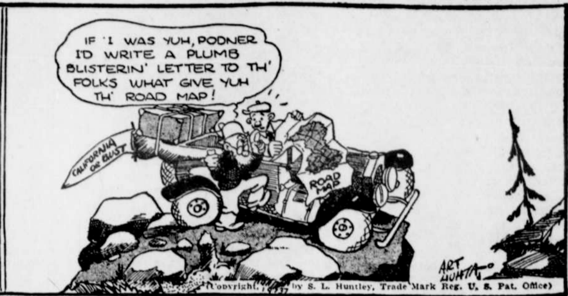
Maybe He Missed the Detour