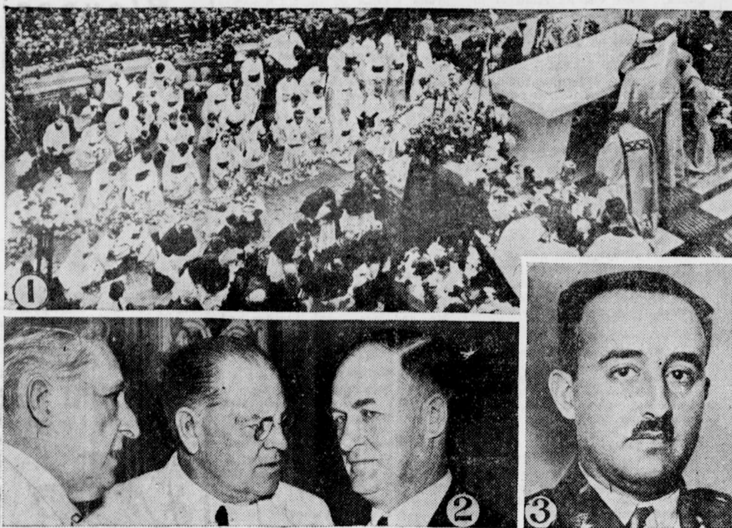
1—Culmination of the Eucharistic congress at Lisieux, France, as Cardinal Pacelli pronounced the blessing on the throng attending the inauguration of the new cathedral. 2—Members of the senate judiciary committee who drafted court bill following the defeat of President Roosevelt's plan. Left to right, Senator King of Utah, Senator Austin of Vermont and Senator Burke of Nebraska. 3—Gen. Francisco Franco, who directed the most concentrated drive yet attempted by the rebel forces on Madrid.