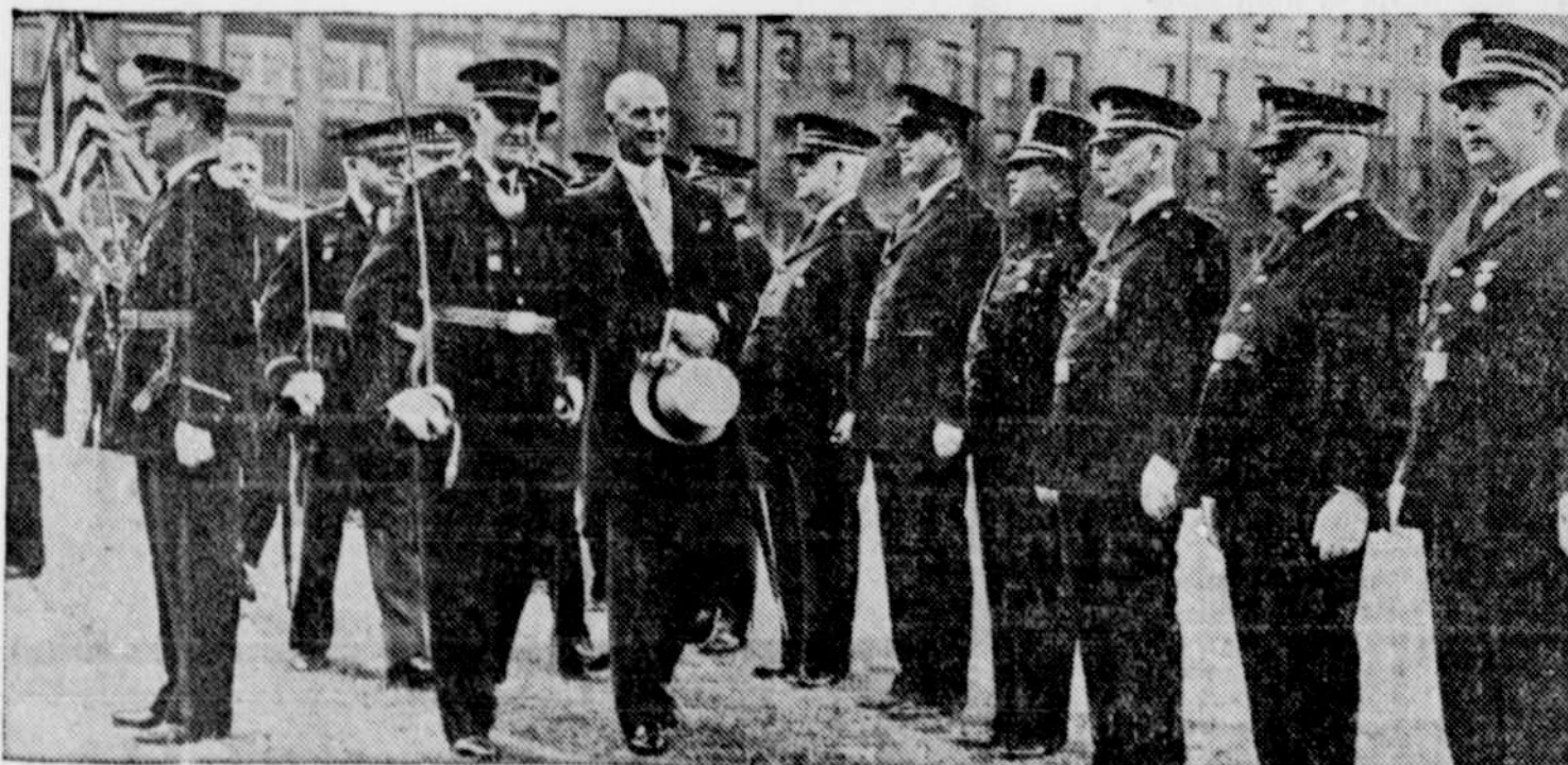
Sir George Broadbridge, the lord mayor of London, inspects the Ancient and Honorable Artillery Company of America during a garden party in honor of the British Honourable Artillery Company on the four hundredth anniversary of its founding recently. The British company is one of the most exclusive regiments in England. The American company dates from 1638 when a group of planters in America who had been members of the British company formed a similar regiment.