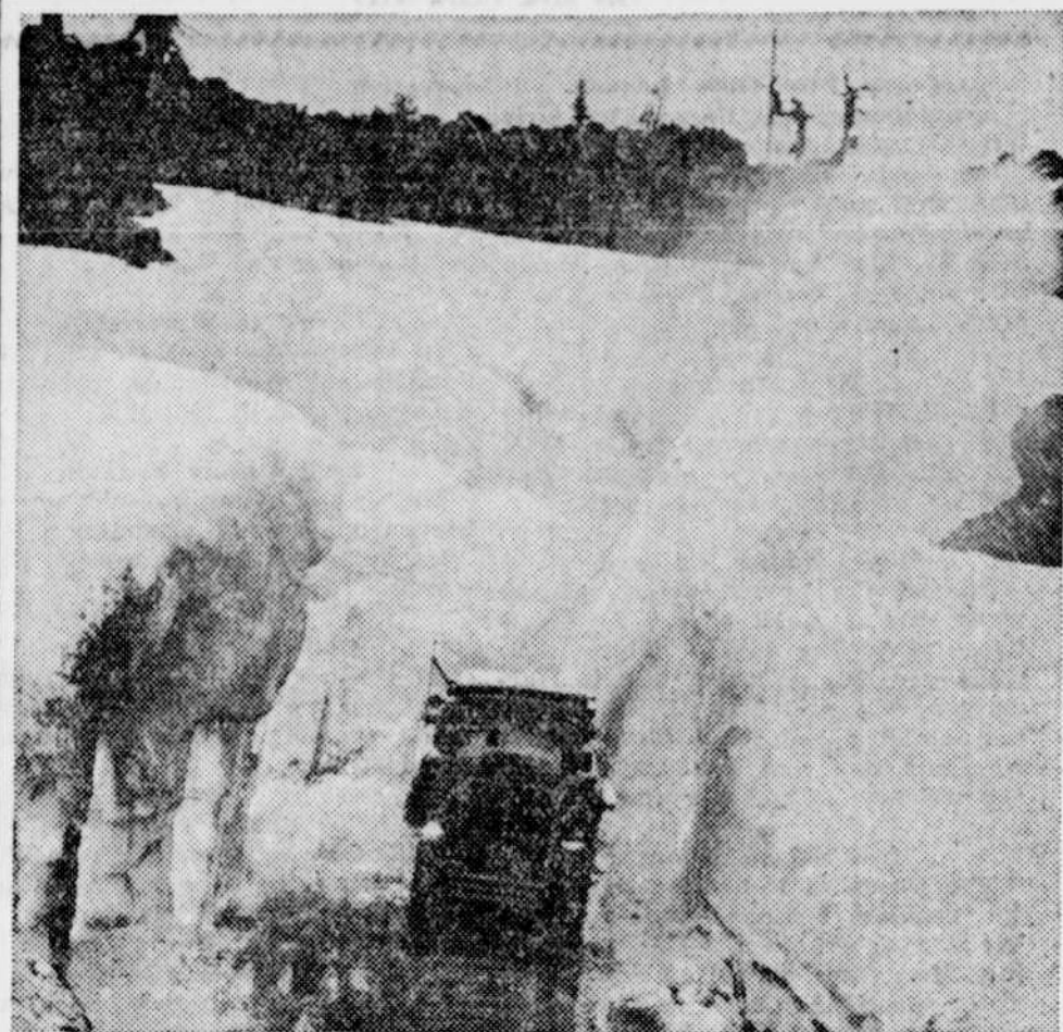
While New Yorkers and Chicagoans are fanning themselves and watching the thermometer, arctic scenes prevail in some parts of Oregon. Here you see a snow plow hard at work on a 40-foot drift in the McKenzie pass high in the Cascade mountains. In some places dynamite is being used to reopen roads that have been blocked with snow since last fall.