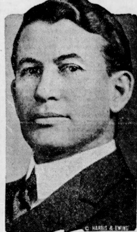
Senator Alben Barkley of Kentucky, who was elected majority leader of the senate to succeed the late Senator Joseph T. Robinson of Arkansas. He received 38 Democratic votes in a close contest with Senator Pat Harrison of Mississippi, who received 37.