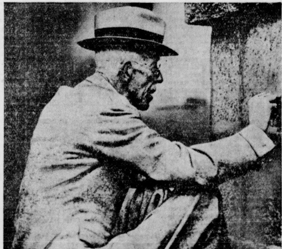
In tailorsque pose, King Gustav of Sweden is pictured seated on the ground as he autographed the memorial stone placed outside the Gothenburg water works during the recent celebration of its one hundred and fiftieth anniversary.