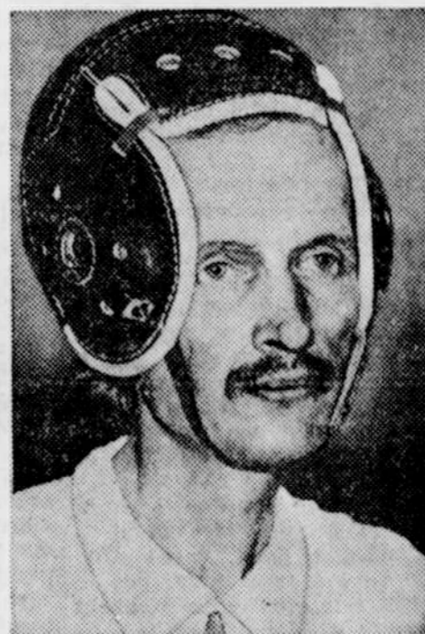
Dr. Jean Piccard, famed stratospherist who miraculously escaped death when his "balloon cluster" craft crashed flaming to earth near Lansing, Iowa, after a takeoff from Rochester, Minn. He estimated he had reached 11,000 feet before starting his descent. The scientist was carried on his flight by a double cluster of 80 small balloons, one cluster above the other.