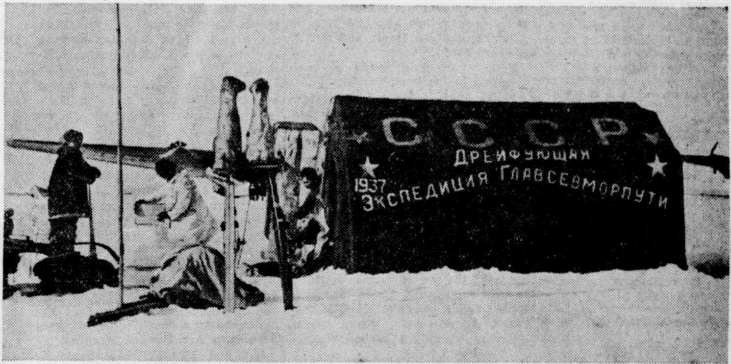
This photograph, brought back by returning members of the Soviet aerial expedition to the North pole, shows the camp established at the pole by the expedition. Parts of the planes, first to land on top of the world, may be seen in background. Four members of the expedition will remain at the pole for a year, studying conditions and atmospheric phenomena. It is planned to establish a base there for a regular Soviet air service between Moscow and the United States.