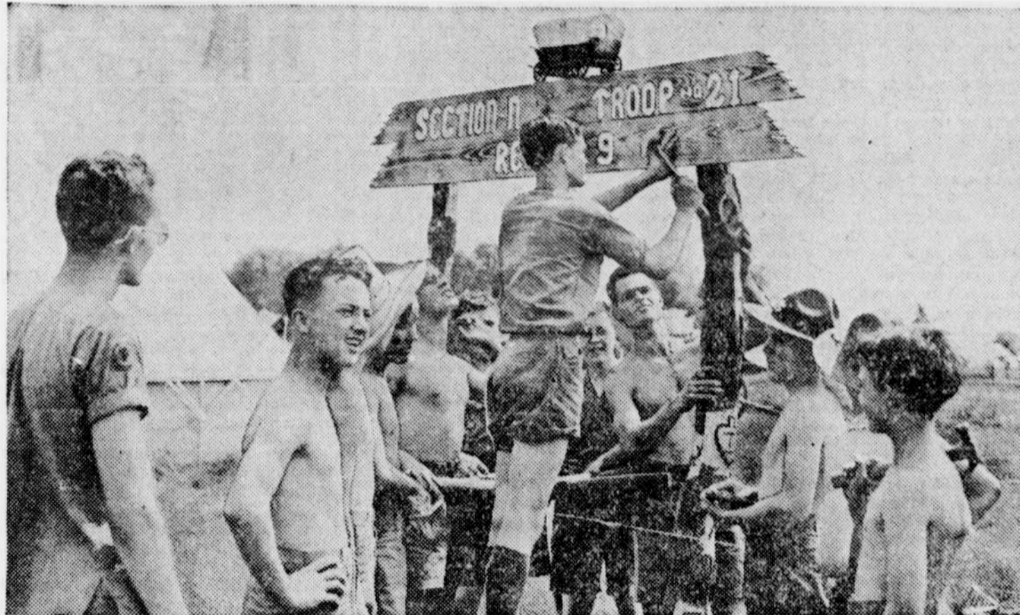
Gathered from all parts of the world, 25,000 Boy Scouts attended the National Scout jamboree at Washington, D. C. Above, Scouts from Albany and Abilene, Texas, are shown erecting their division sign at the camp close by the Potomac river. The cost of the camp and the expenses of the Scouts en route and back home were estimated at more than $2,000,000.