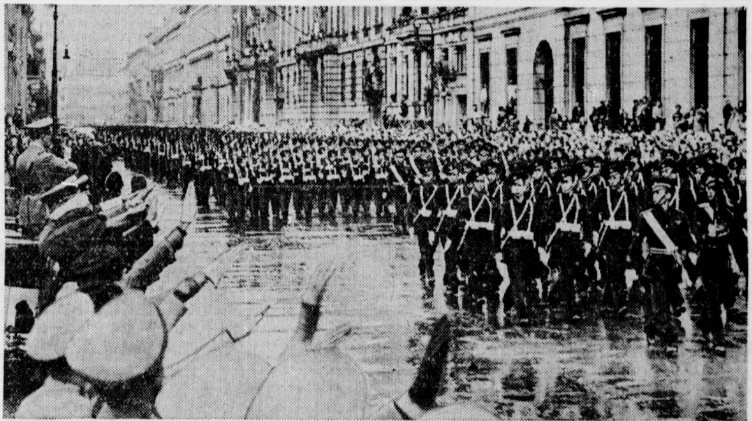
Returning a visit made to Rome by the Nazi youth organization last year, the Battalion of Ballila, or Italian Fascist youth organization shown above, is pictured in Berlin as it was inspected recently by Chancellor Adolf Hitler, who is seen at the left taking the salute from the youthful Black Shirts.