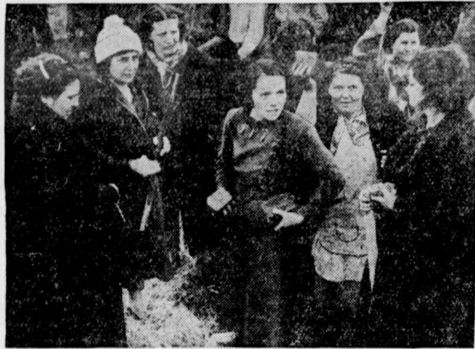
Monroe (Mich.) Women Defended Their Husbands' Right to Strike.

Nine Shot as Violence Continues . . . Coal Strikers Aid Steel Pickets...Bilbao's End Nears...Hopkins Checked