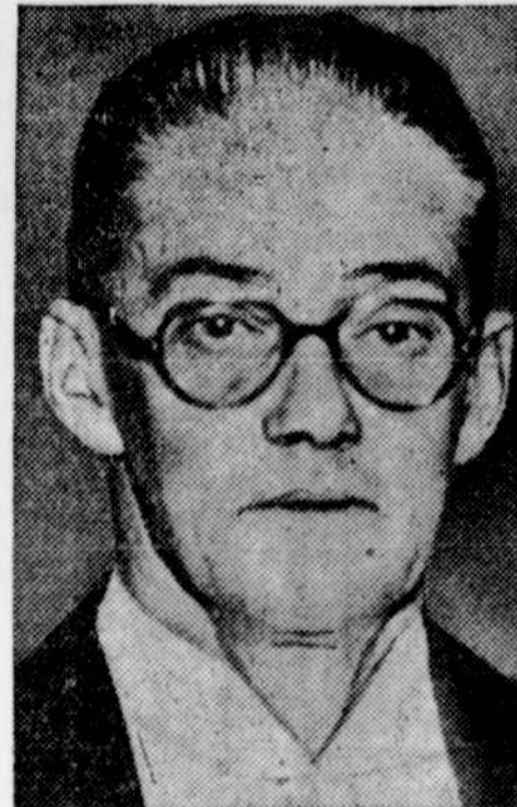
Baron Nuffield, who is Sir William Morris, head of a vast manufacturing organization including automobile plants, export companies, a publishing house and affiliated subsidiaries, donated $10,000,000 to stimulate employment in Great Britain's "depressed areas" to show his support of the government of King George VI. Twice before he gave substantial gifts.