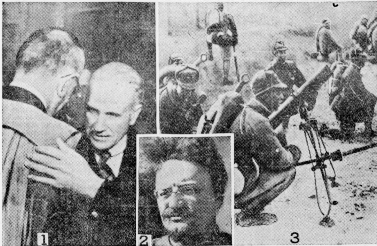
1—Dr. Frederico Laredo Bru being sworn in as president of Cuba, following the ousting of President Miguel Gomez. 2—Leon Trotsky, former Soviet leader who has been given an exile haven in Mexico. 3—Chinese National army that threatened civil war before the release of kidnaped Marshal Chiang Kai-shek.