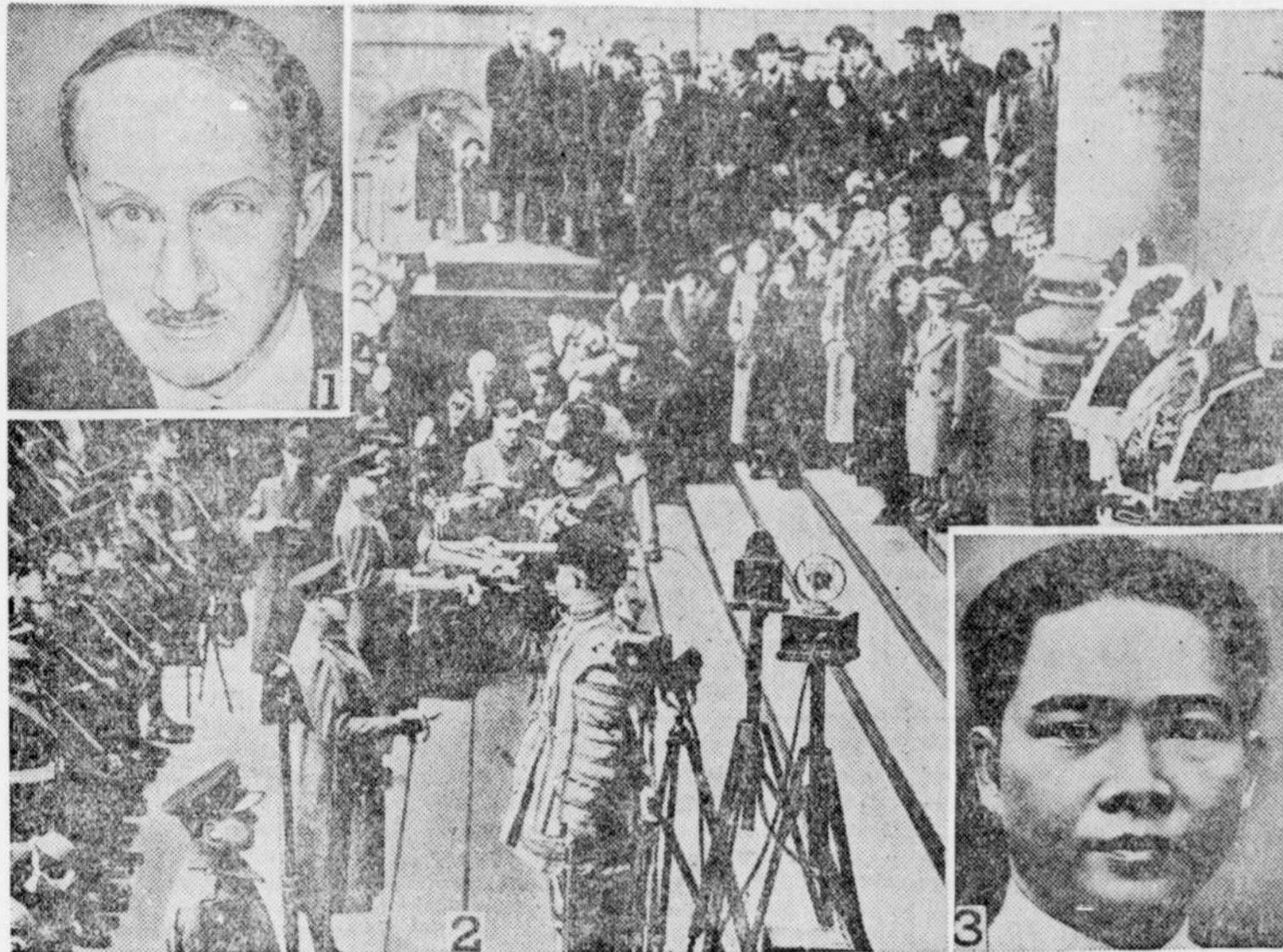
1—Georges Bonnet, former minister of finance, now slated to become French ambassador to the United States. 2—Ceremonies in London at which the Duke of York was officially proclaimed King George VI of England. 3—Generalissimo Chiang-Kai-shek of China who was recently kidnaped and held captive by rival war lords.