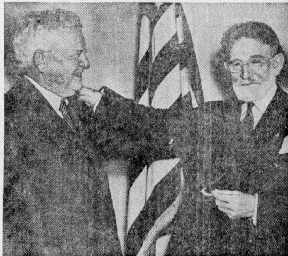
Vice President John N. Garner and U. S. Senator James Hamilton Lewis of Illinois, whip of the senate, are seen conferring over plans for the opening of the new Seventy-fifth congress.