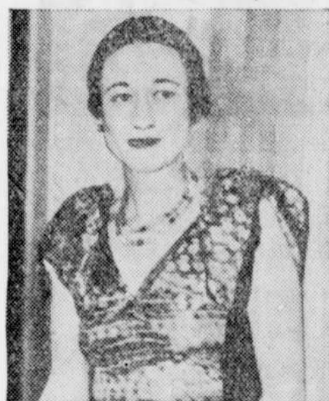
Picture made at a recent London reception of Mrs. Wallis Warfield Simpson, former Baltimore beauty and friend of ex-king Edward VIII of England. A government crisis was precipitated in England as the British cabinet, headed by Prime Minister Baldwin, attempted to persuade the king to halt his plans to wed the American woman.