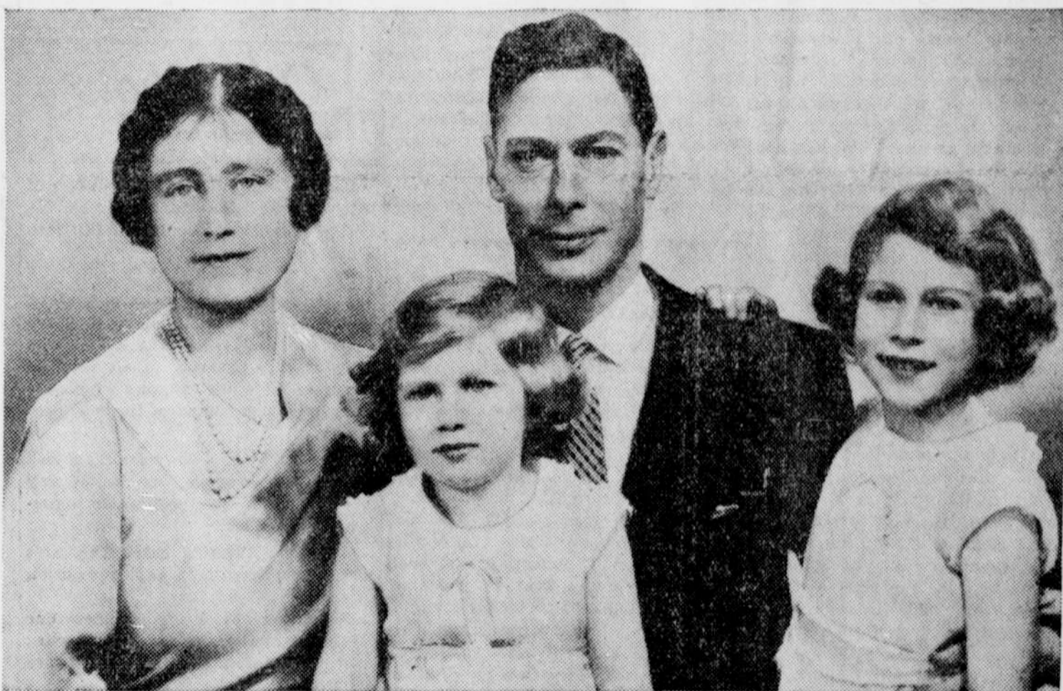
On the abdication of King Edward VIII, to marry Mrs. Wallis Simpson, his brother, the Duke of York, ascended the throne of England as George VI. It is expected the coronation will take place next June. Photo shows King George with Queen Elizabeth and daughters, Princesses Elizabeth and Margaret Rose.