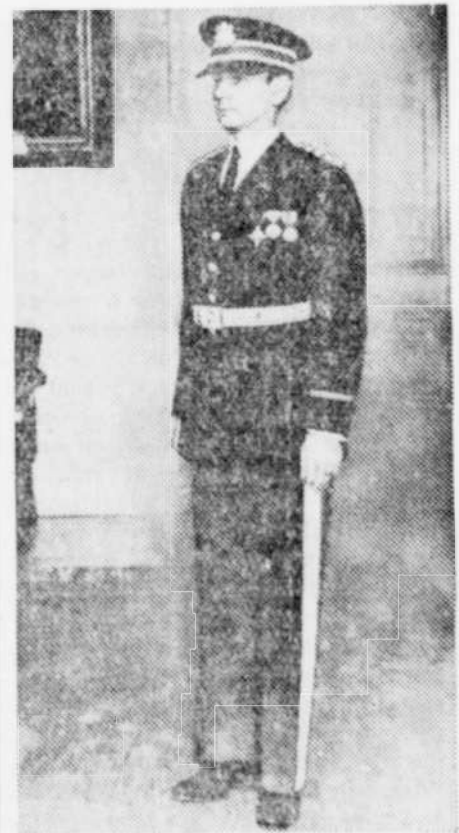
An officer's full dress uniform of blue which has recently been adopted by the War department. The new uniform has a roll collar coat and light blue trousers, and its wear is to be optional. Officers who are in possession of the old blue uniforms will be permitted to wear them without a time limit, according to a ruling of the War department at Washington, D. C.