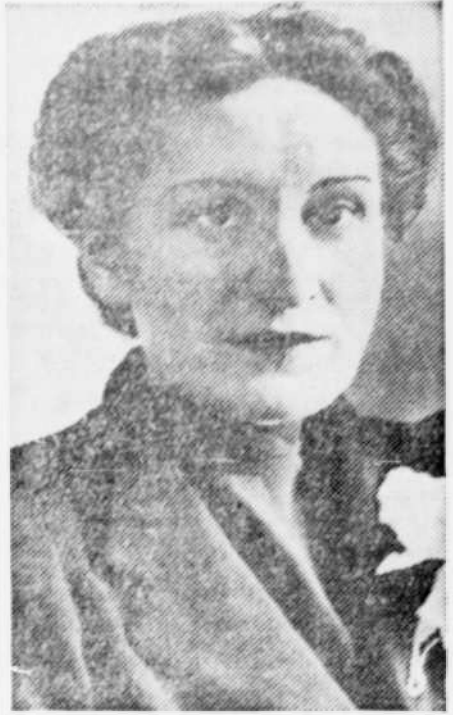
The Countess Galeazzo Ciano, the former Edda Mussolini, daughter of Italy's premier, who, according to reports, will visit New York and Washington early this winter. The countess is the wife of Foreign Minister Ciano, who may succeed Il Duce when the latter retires from political life.