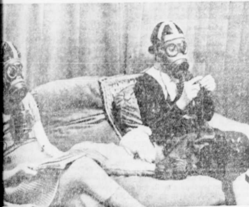
Not quite a peaceful home scene as mother and daughter, wearing gas masks, continue at their knitting during the recent rehearsal of air defenses in Paris.