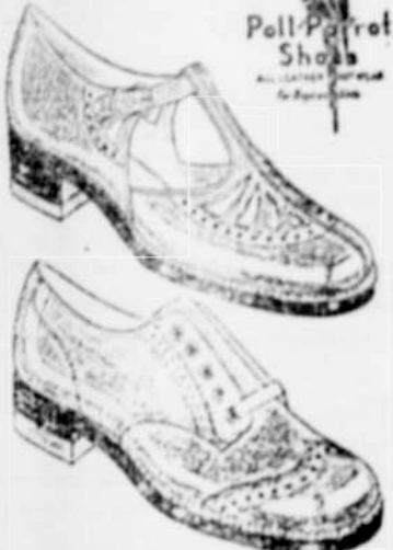
Poll Parrot Shoes