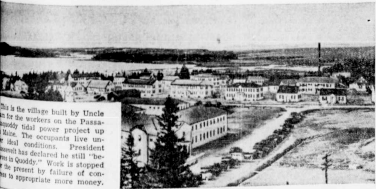
This is the village built by Uncle Sam for the workers on the Passamaquoddy tidal power project up in Maine. The occupants live under ideal conditions. President Roosevelt has declared he still "believes in Quoddy." Work is stopped for the present by failure of congress to appropriate more money.