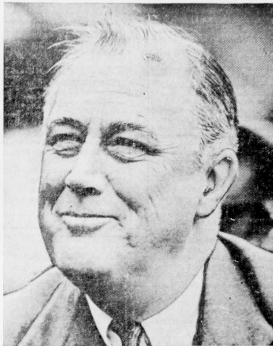
President Roosevelt appeared to be well rested and in excellent condition for the strenuous work in connection with his campaign for re-election this fall as the cameraman caught him in an informal pose at the end of his vacation yacht cruise in the Bay of Fundy.