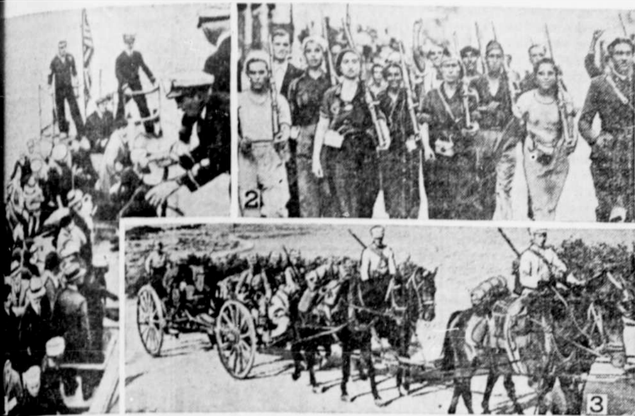
1—American refugees from Bilbao, Spain, being taken aboard the U. S. S. Oklahoma for transportation to France. 2—Women of the loyalist forces of Spain marching out to battle with the rebels north of Madrid. 3—Battery of Turkish artillery entering the former demilitarized zone on the Dardanelles which Turkey is re-arming.