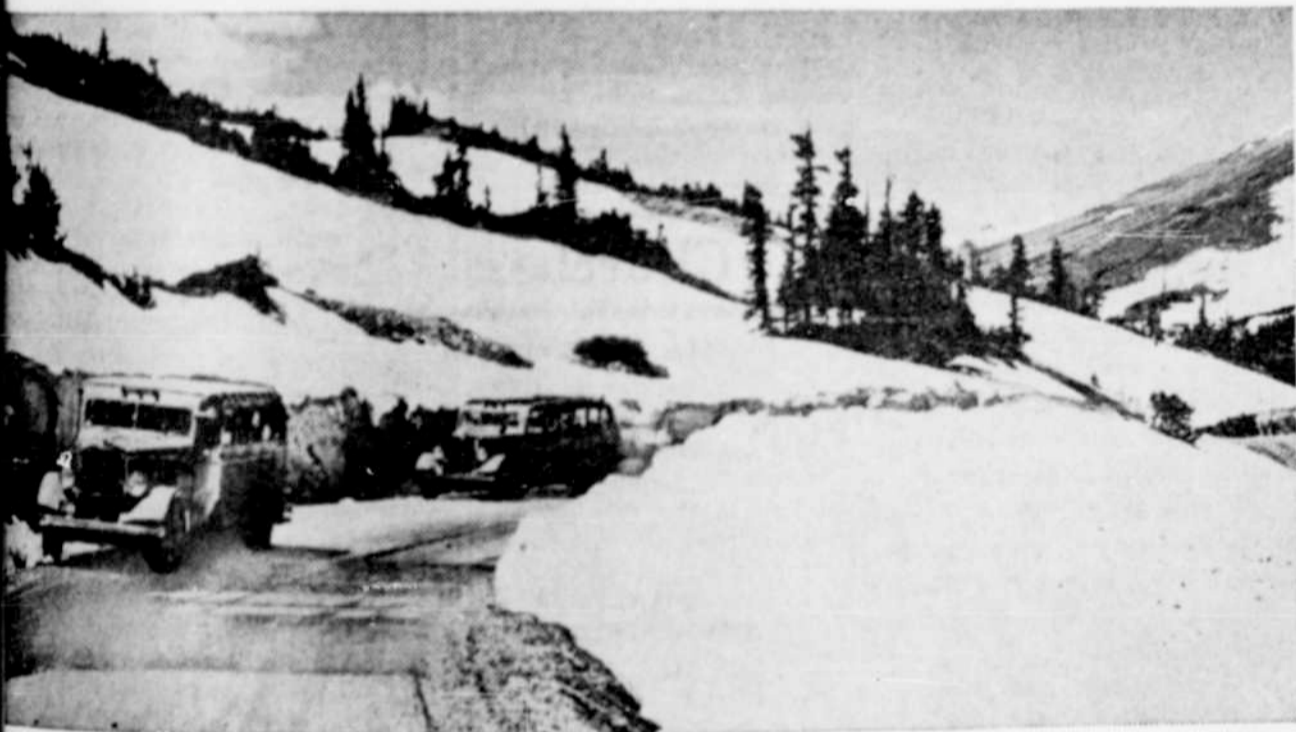
This picture, taken during the unprecedented hot spell that afflicted most of the country, shows a view along the Trail Ridge road in Colorado's Rocky Mountain national park.