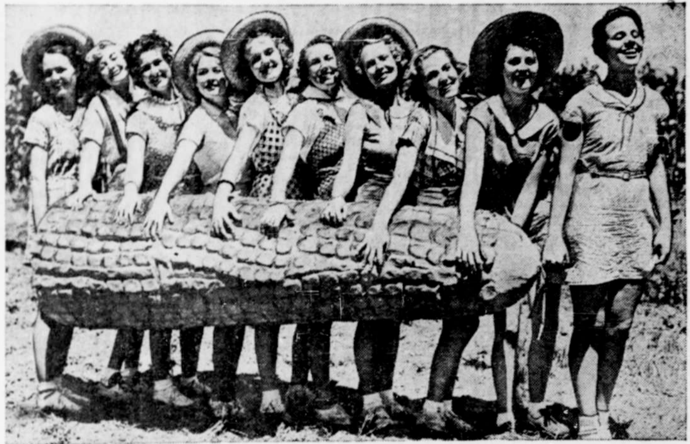
It really doesn't grow this large in Southern California, but this oversized ear of corn has been prepared for one of the displays of the famous Los Angeles county fair which opens at Pomona in September.