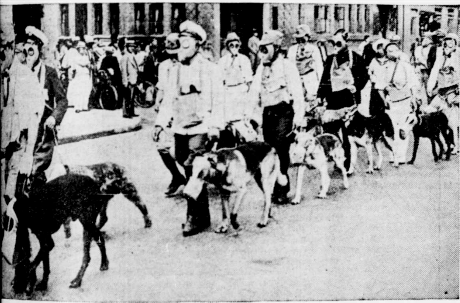
Tokyo.—Civilians and their dogs parade through the streets of the Japanese capital wearing gas masks as a demonstration of the preparedness of the civilian population for a gas attack when and if the next war comes.