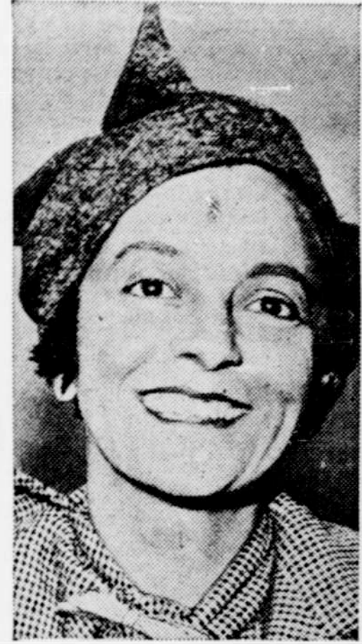
In a momentous decision based on "divine inspiration," Elsie Janis, one-time popular stage star and "sweetheart of the A. E. F." during the World war, has disclosed plans to dispose of her worldly possessions and to devote the proceeds and her life to local charities.