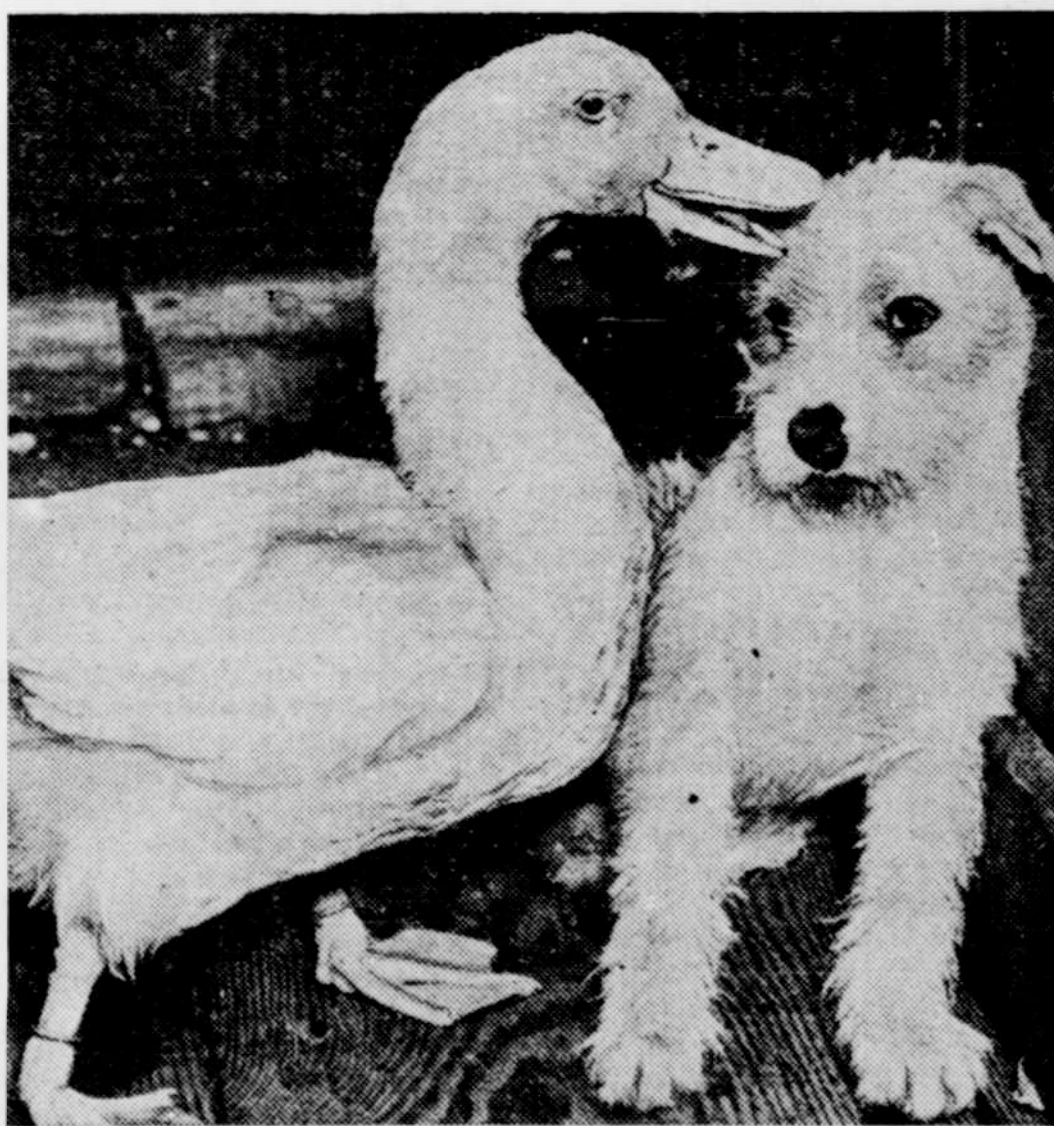
Hardtack, a white Pekin duck, and Fritz, a wire-haired fox terrier, pet of a woman in Santa Monica, Calif., are fast friends and make daily appearances at the local pleasure pier. Hardtack's favorite diversion is nipping Fritz's short hairs.