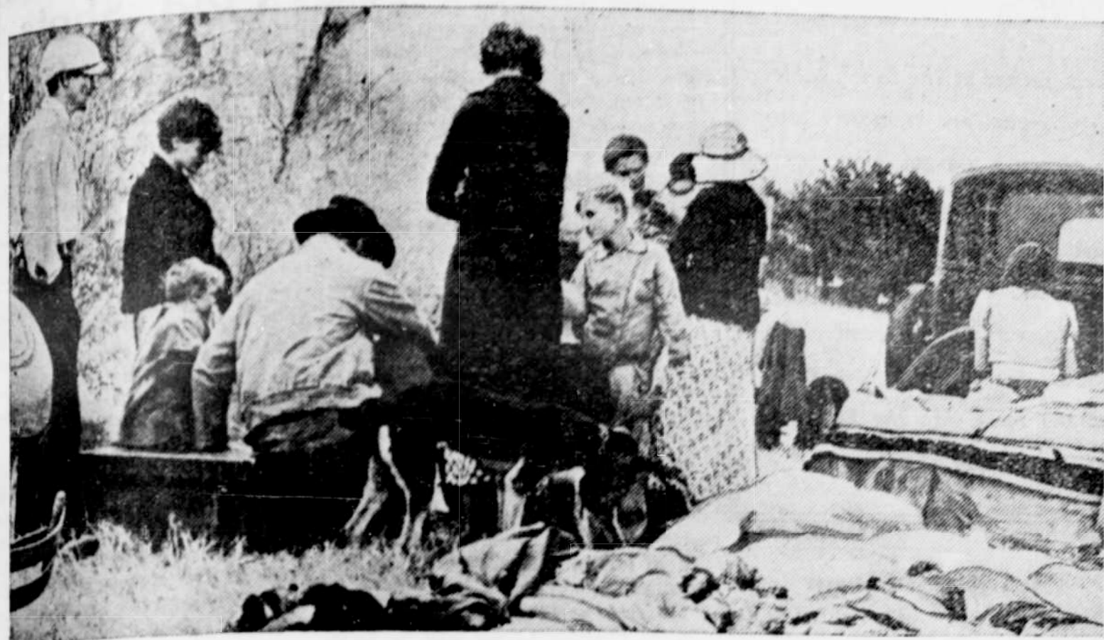
Penniless, without shelter and looking for work, these refugees from the drouth-ridden "Dust Bowl" have become squatters along the highway near Bakersfield, Calif. There are 22 in the family which came from Oklahoma. Government assistance to drouth victims is helping to alleviate suffering. A three-fold program embodying WPA jobs, loans by the Resettlement administration and the purchase of cattle is under way to meet immediate emergencies.