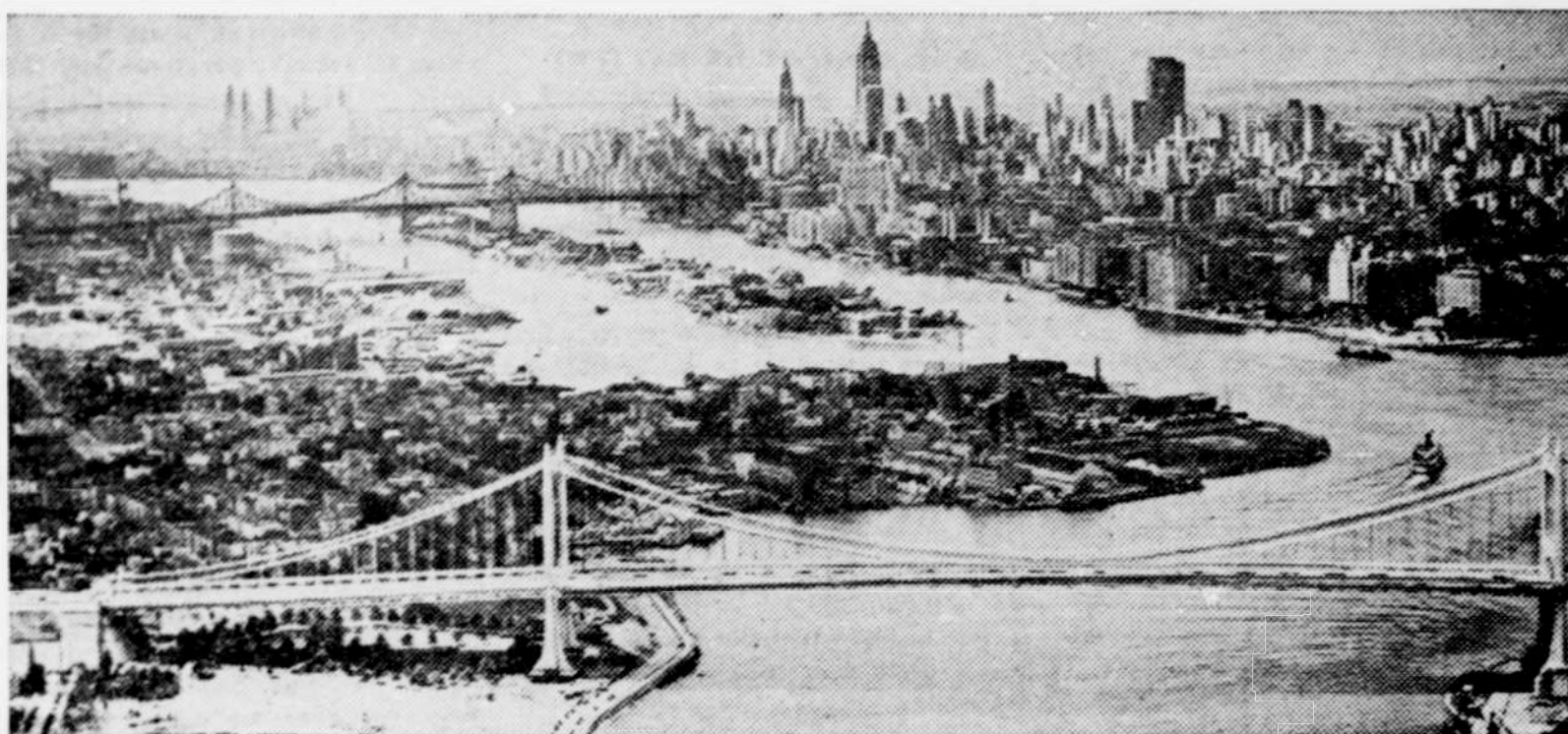
The massive Triborough bridge linking Manhattan, the Queens and the Bronx, which was recently dedicated by President Roosevelt. It was built at a cost of $64,000,000 by the PWA. Photo shows one of the main spans in this great chainwork which is second in size to the Golden Gate bridge in San Francisco.