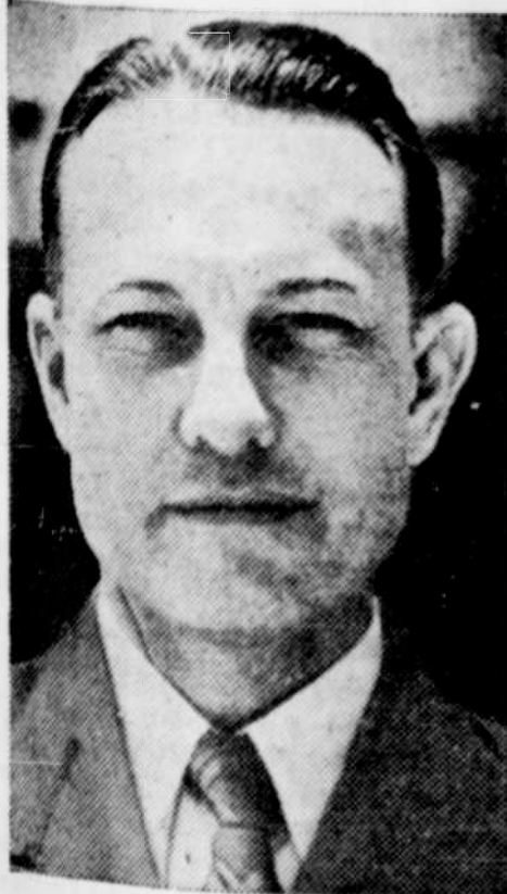
Oklahoma from statehood in 1907 until 1920 when he was beaten. Senator Gore was called out of retirement six years ago by a heavy vote.

Rep. Josh Lee, the "boy orator" who defeated blind Senator Thomas E. Gore in the senatorial primary in Oklahoma. He took issue with the anti-New Deal views of the veteran who had represented