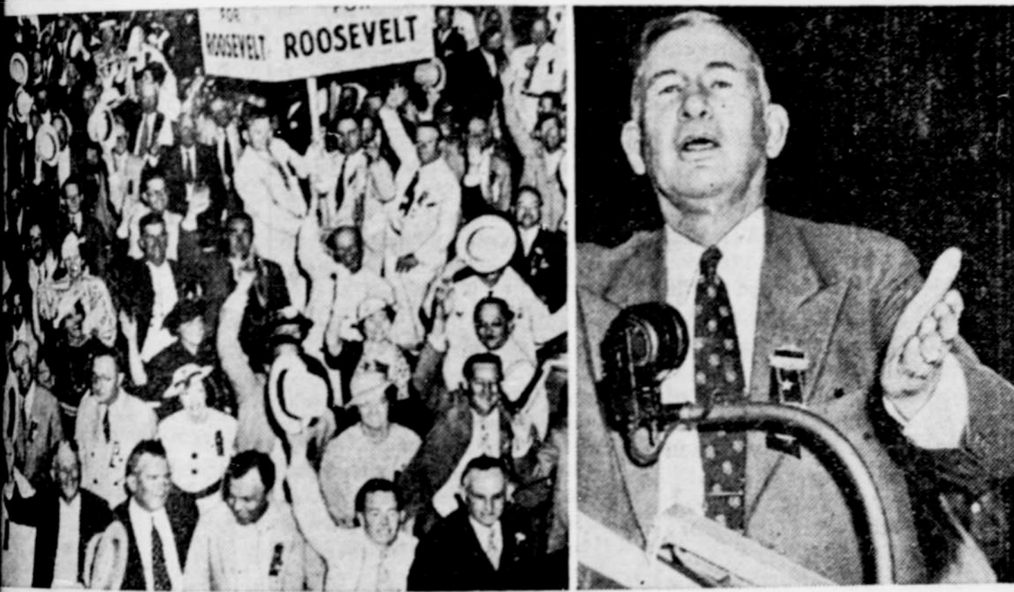
Scenes of wild enthusiasm marked the renomination of Franklin D. Roosevelt for the Presidency at the Democratic National convention at Philadelphia. Inset shows Senator Albin Barkley of Kentucky, Democratic keynoter.