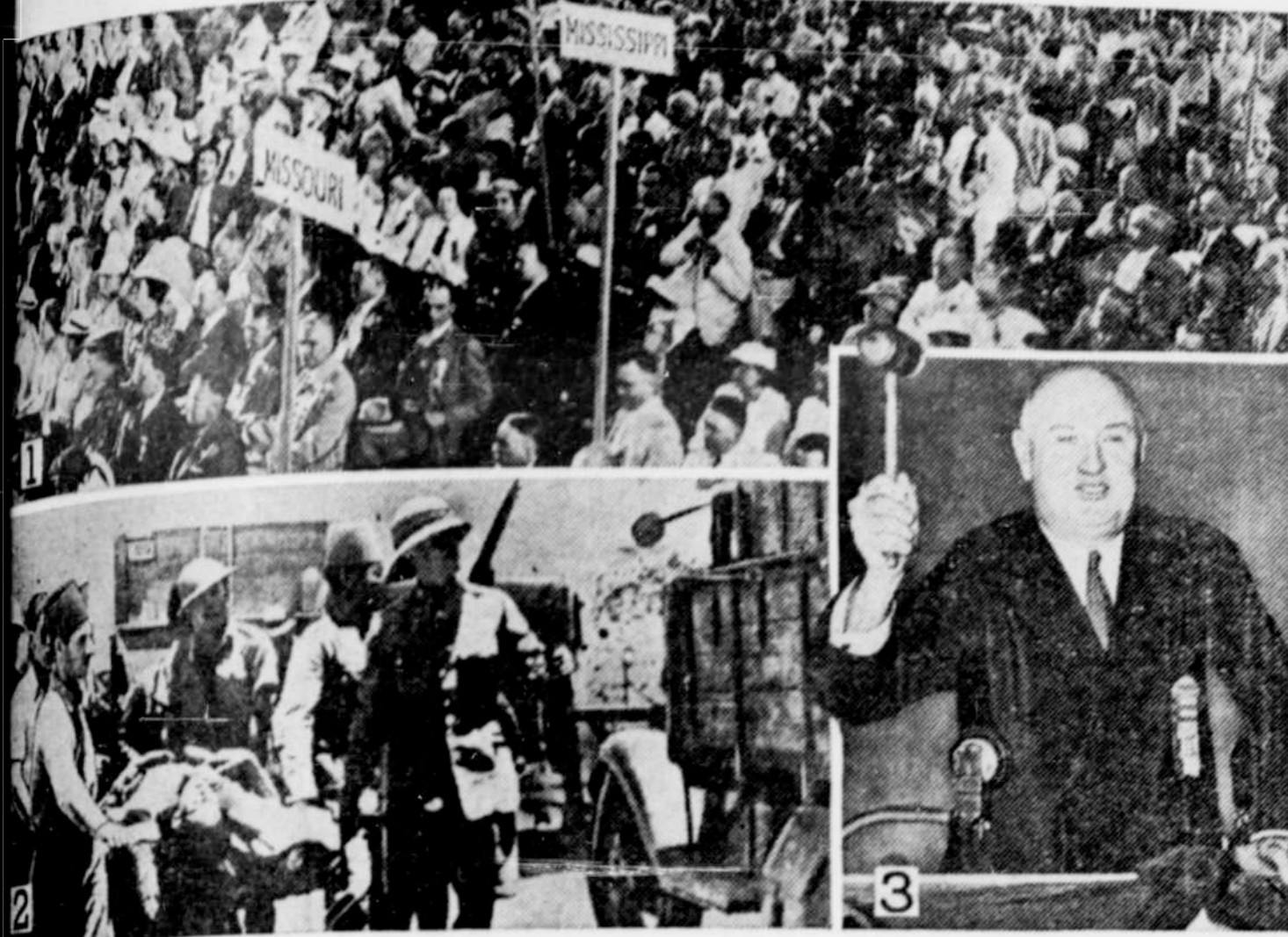
1—Scene at the Democratic National convention in Philadelphia which renominated President Roosevelt. 2—Further outbreaks of violence in Jerusalem result in fatal wounding of an Arab school teacher. 3—James A. Farley, chairman of the Democratic National committee, opening the convention.