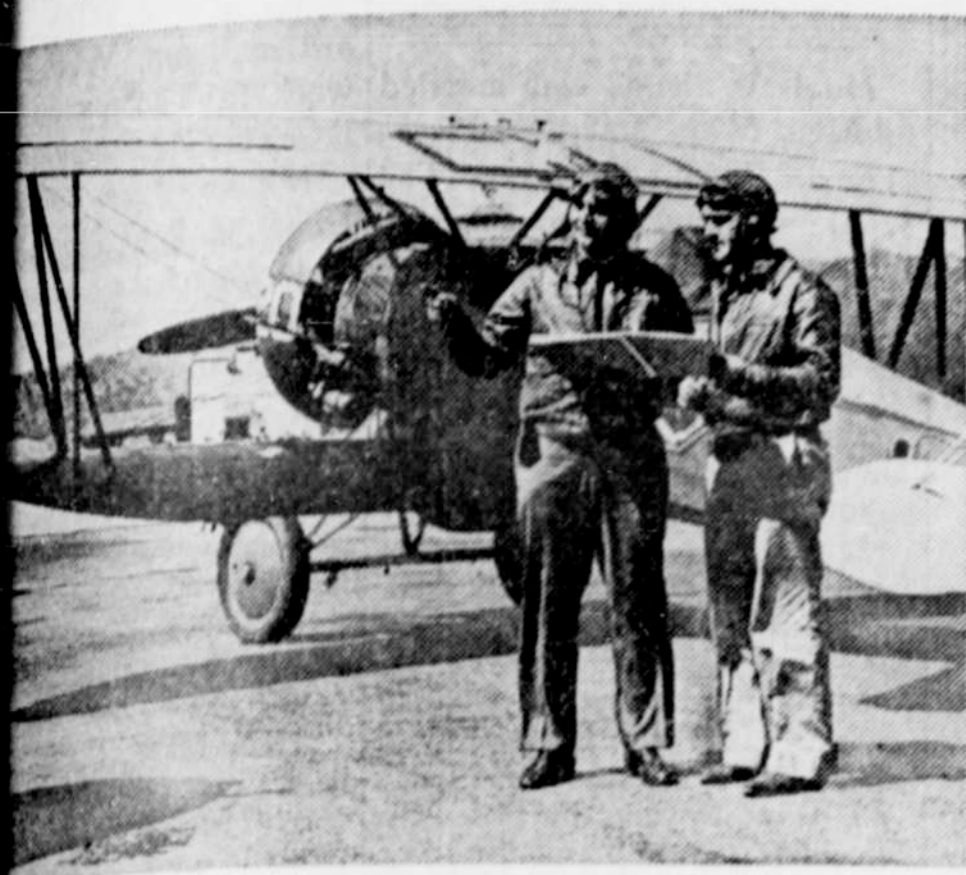
Maj. Ira C. Eaker, U. S. A., left, and Maj. William E. Kepner, U. S. A., are pictured at Union air terminal, Burbank, Calif., just after the former completed the first trans-continental blind flight. The latter, flying another single-seater, flew in formation with Major Eaker and served as the pilot of the blind flyer by calling him every five minutes on the radio.