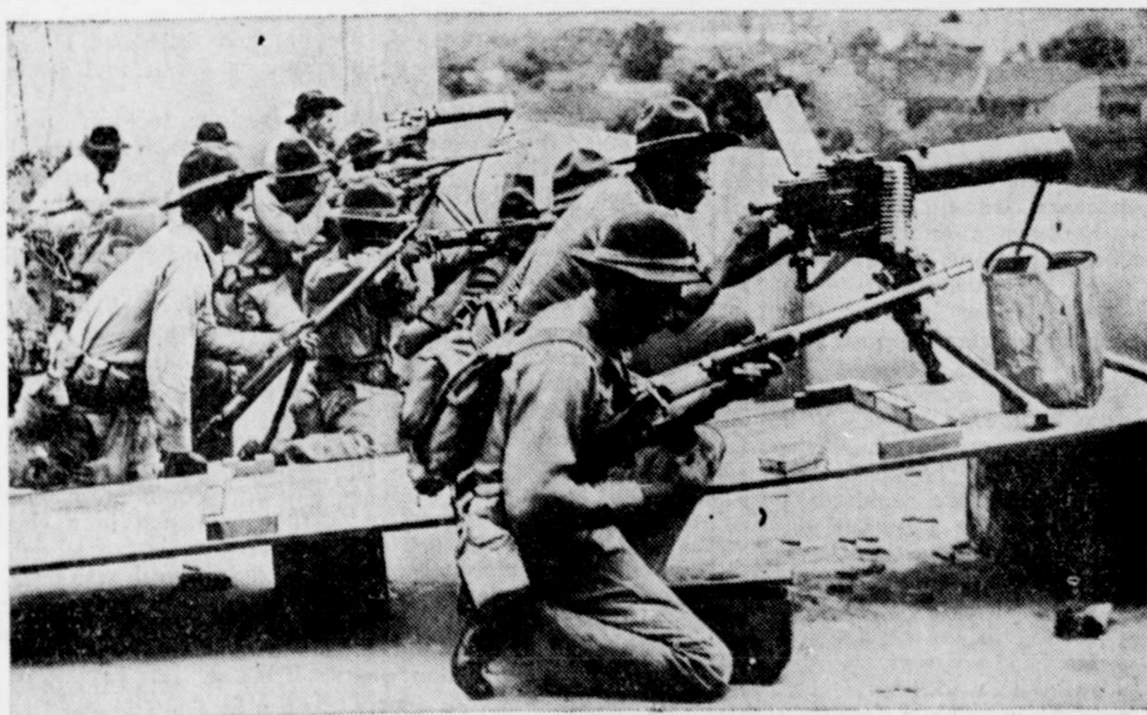
National Guardsmen, American-trained, who led the revolt that forced resignation of President Juan B. Sacasa, are shown on top of the national bank building during fighting in the capital. The machine gun units shown here did considerable damage to federal forces.