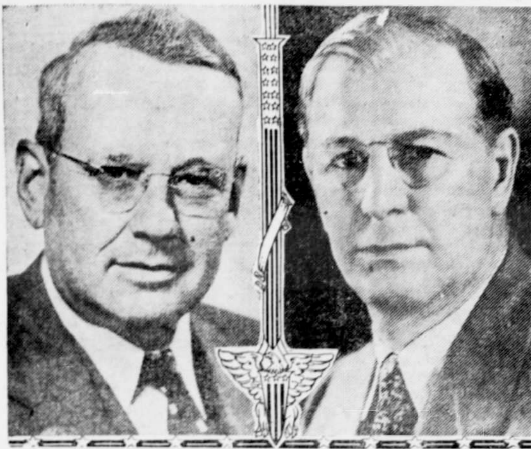
ALF M. LANDON